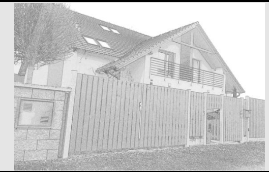
We sell a family new built house with a flat roof 6 rooms 150 m2. The house has two floors and is located in a quiet small village (900 residents). Shops availability, hospital in the city is 3km. The costs of running the house are low. The house is equipped with a kitchen and a bathroom, the other rooms are empty. 1056 m² land size.