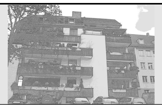
Flat sale – 3 rooms, 85 m² with a balcony in a quiet part of the uptown of the historic center (500,000 residents). The apartment is maintained, the reconstruction of bathroom and kitchen was carried out. Parking available at the house. Residential building is from 1960. Private ownership.